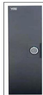
FRONT OF VAULT

Lock: S&G Spartan UL Type-1 high security E-Lock